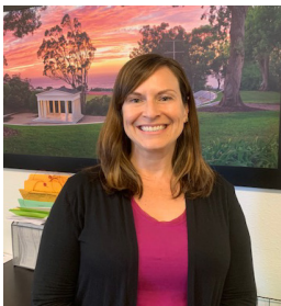
Heather Garcia School of Nursing