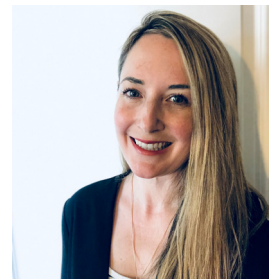
Molly Sperry School of Nursing

"Rest is not idleness, and to lie sometimes on the grass under the trees on a summer's day, listening to the murmur of water, or watching the clouds float across the sky, is by no means a waste of time."